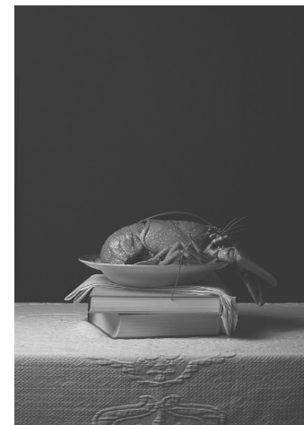
Time line , 2014 50x70cm Ed. 5 + PA £375.00 £475.00 (framed)