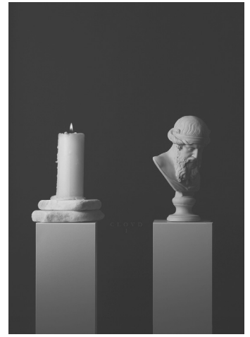
CLOVD I , 2014 50x70cm Ed. 5 + PA £375.00 £475.00 (framed)