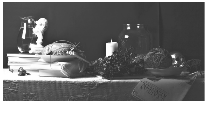
Time Capsule , 2014 100x70cm Ed. 1/5 (only one available for sale) Silent auction (piece includes frame on display) Starting price: £150.00