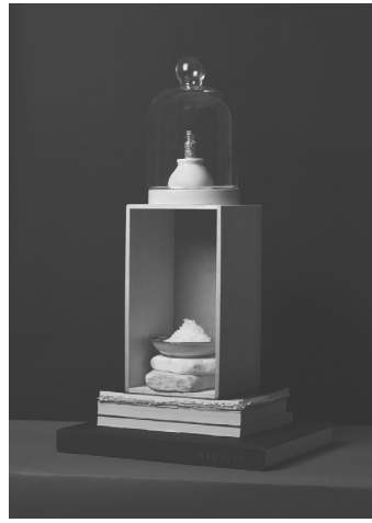
Bitcoin , 2014 50x70cm Ed. 5 + PA £375.00 £475.00 (framed)