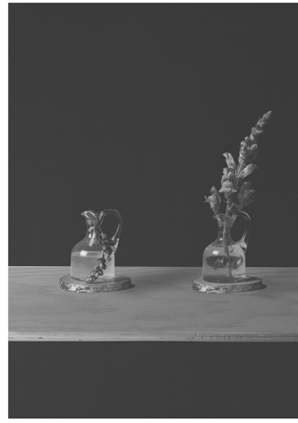
Calico , 2014 50x70cm Ed. 5 + PA £375.00 £475.00 (framed)