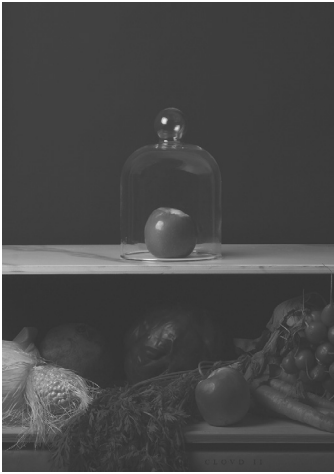
CLOVD II , 2013 50x70cm Ed. 5 + PA £375.00 £475.00 (framed)