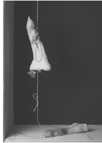
Google Glass , 2014 50x70cm Ed. 5 + PA £375.00 £475.00 (framed)