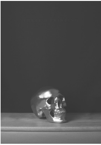
3D Printing , 2013 50x70cm Ed. 5 + PA £375.00 £475.00 (framed)