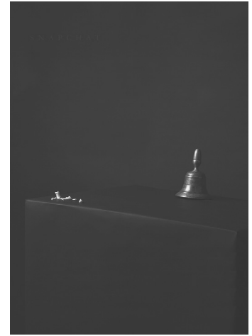
Snapchat , 2014 50x70cm Ed. 5 + PA £375.00 £475.00 (framed)